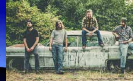
WINTERSTOCK Fri Feb 1 | 7:30pm | Tickets $20 at the door $25 Lincoln Theatre Members receive $2 off.