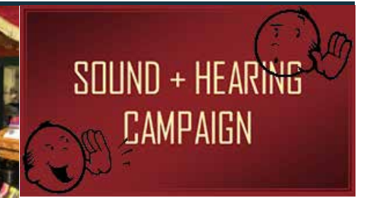
BRING SOUND TO LIFE . . . Support the Lincoln Theatre in bringing state-of-the-art sound and hearing assistance to live performances and film.

Concessions volunteers enjoy a free show, popcorn and fountain drinks. Find Volunteer Application and Disclosure Form at lincolnthatre.org/be-volunteer or in our office. Email to brandy@lincolnthatre.org . Volunteering is conditional on completed application, disclosure form and satisfactory report from the WA State Patrol.