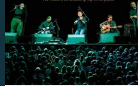
LUNASA Fri Mar 1 | 7:30pm | $20-$35 Lincoln Theatre Members receive $2 off.

The story takes place in 1950's Hell's Kitchen - New York city's notorious gangland battleground. We follow the two main characters, Tony, the founder of the Jets, and Maria, the sister of the leader of the rival gang, the Sharks. As the story unfolds, we follow the star-crossed lovers struggle to survive in a world of hate, violence and prejudice - creating one of the most innovative, heart-wrenching and relevant musical dramas of our time.