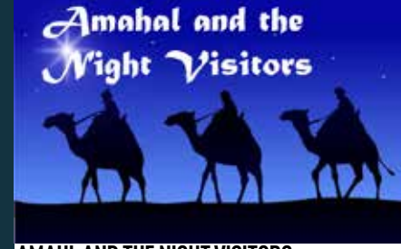
AMAHL AND THE NIGHT VISITORS Tues Dec 18 & Wed Dec 19 | 7:30pm | $10-$22

TICKETS ALSO AVAILABLE online at lincolnthatre.org