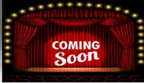
FILM TBD December 29-31

The Lincoln Theatre will screen an as yet to be named, first run film December 29th through December 31st. Look out for the title soon to be announced.