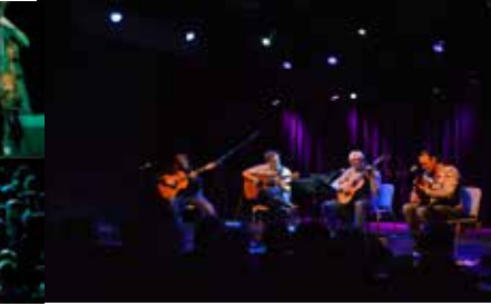
INTERNATIONAL GUITAR NIGHT Sat Mar 2 | 8:00pm | $24-$39 Lincoln Theatre Members receive $2 off.

Named for an ancient Celtic harvest festival in honor of the Irish god Lugh, patron of the arts, Lúnasa is indeed a gathering of some of the top musical talents in Ireland. They tour and perform internationally, and have recorded a number of albums of both traditional and contemporary Irish instrumental music.