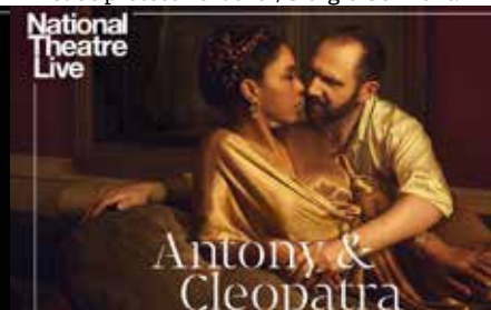
NT LIVE: ANTONY & CLEOPATRA January 6 | 12:00pm | Advance Tickets: $14-18 Lincoln Theatre Members receive $2 off

The Madness of George III is a multi-award winning play dramatising the final years of King George III's reign of the United Kingdom, his battle with mental illness and the inability of the court to handle his condition. Written by one of Britain's best-loved playwrights Alan Bennett, known for his much celebrated plays The History Boys and The Lady in the Van.