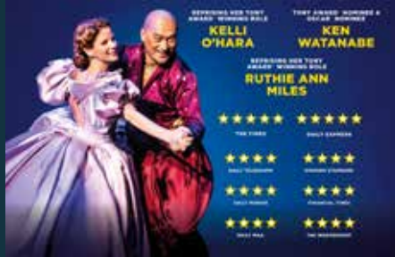
THE KING AND I Tues Dec 4 | 7:00pm | Tickets: $14-18 Lincoln Theatre Members receive $2 off.

Set in 1860s Bangkok, the musical tells the story of the unconventional and tempestuous relationship that develops between the King of Siam and Anna, a British schoolteacher whom the modernist King, in an imperialistic world, brings to Siam to teach his many wives and children.