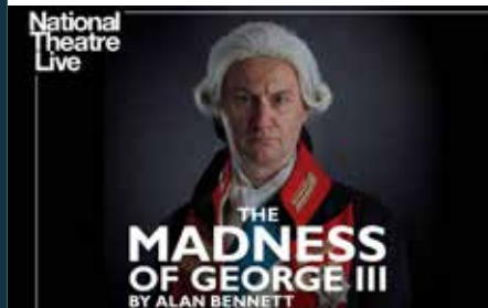
NT LIVE: THE MADNESS OF GEORGE III Sun Dec 30 | 12:00pm | Advance Tickets: $14-18 Lincoln Theatre Members receive $2 off

The Madness of George III is a multi-award winning play dramatising the final years of King George III's reign of the United Kingdom, his battle with mental illness and the inability of the court to handle his condition. Written by one of Britain's best-loved playwrights Alan Bennett, known for his much celebrated plays The History Boys and The Lady in the Van.