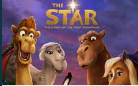
THE STAR December 1 | 3:00pm

The City of Mount Vernon's annual free holiday screening! Easily the most slapstick version of the Nativity story ever made and one that finally pays tribute to the critical part played by all the talking animals at the manger on that night.