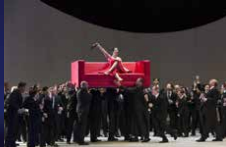
THE MET LIVE IN HD: LA TRAVIATA Sat Dec 15, 9:55am & Sun Dec 23, 1:00pm | $17-23 Lincoln Theatre Members receive $2 off.

Set in 1860s Bangkok, the musical tells the story of the unconventional and tempestuous relationship that develops between the King of Siam and Anna, a British schoolteacher whom the modernist King, in an imperialistic world, brings to Siam to teach his many wives and children.