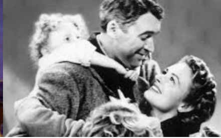
IT'S A WONDERFUL LIFE December 22 | 6:30pm

A family holiday film gifted to the community and made possible by a generous grant from the Theater Arts Guild (TAG), Friends of Film and hosted by the Historic Lincoln Theatre.