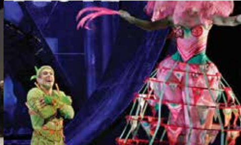
THE MET LIVE IN HD: THE MAGIC FLUTE Sat Dec 22 | 1:00pm | $17-23 + fees Lincoln Theatre Members receive $2 off.

Met Music Director Yannick Nézet-Séguin conducts Verdi's timeless tragedy La Traviata. Directed by Michael Mayer, this new production features a dazzling 18th-century setting that changes with the seasons. Diana Damrau is the doomed heroine Violetta, opposite Juan Diego Flórez as her lover, Alfredo, and Quinn Kelsey as Alfredo's protective father, Giorgio Germont.