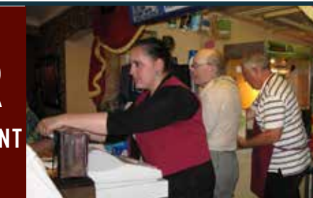
VOLUNTEER AT THE LINCOLN! Flexible Volunteer Opportunities in Concessions and more!

The Lincoln Theatre is supported by more than 800 members from every corner of Skagit. Whatcom and Snohomish counties as well as towns and cities throughout Washington, British Columbia, and around the world. Become a member today and make sure the curtain keeps rising!