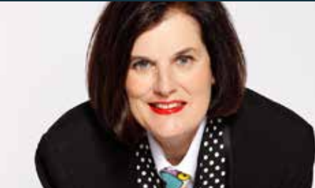
PAULA POUNDSTONE Sat Apr 28 | 8:00pm | Tickets $35 - $65 $2 Lincoln member discount