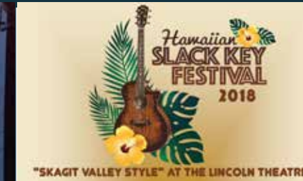
HAWAIIAN SLACK KEY FESTIVAL Sun Mar 18 | 3:00pm | $25 $2 Lincoln Member discount