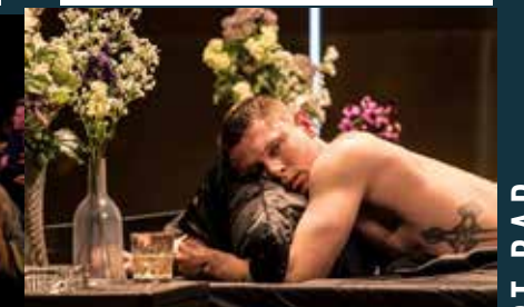
NT Live Cat on a Hot Tin Roof Sun Feb 25 | 1:00pm $14-$18 + fees | $2 member discount