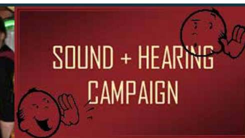
BRING SOUND TO LIFE . . . Support the Lincoln Theatre in bringing state-of-the-art sound and hearing assistance to live performances and film.

Concessions volunteers enjoy a free show, popcorn and fountain drinks. Find Volunteer Application and Disclosure Form at lincolnthatre.org/be-volunteer or in our office. Email to brandy@lincolnthatre.org. Volunteering is conditional on completed application, disclosure form and satisfactory report from the WA State Patrol.