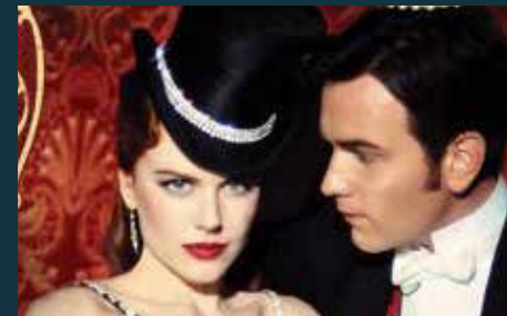
SPECTACULAR, SPECTACULAR FILM SERIES: MOULIN ROUGE Wed Feb 14 | 7:30pm *Drink Specials in the Art Bar

Christian meets the absinthe- and alcohol-addicted artist Henri de Toulouse-Lautrec, who introduces him to a world of sex, drugs, music, theater, and the scandalous dance known as the cancan, all at the Moulin Rouge, a decadent dance hall, brothel, and theater that's the brainchild of Harold Zidler.