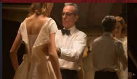
PHANTOM THREAD February 18-21

Regular Film Prices | 125 minutes | PG-13