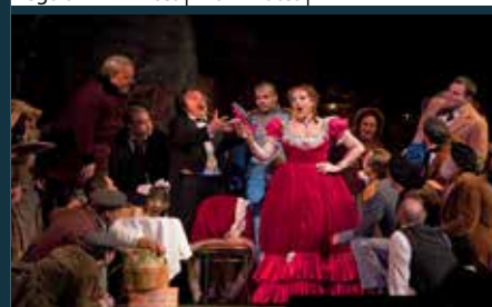
MET Opera La Boheme Sat Feb 24, 9:30am and Sun Mar 11, 1:00pm $17-$23 + fees | $2 member discount