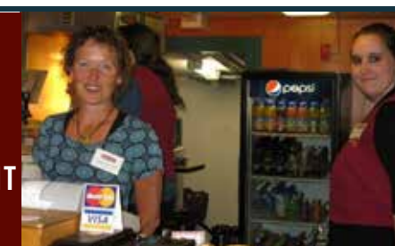
VOLUNTEER AT THE LINCOLN! Flexible Volunteer Opportunities in Concessions and more!

The Lincoln Theatre is supported by more than 800 members from every corner of Skagit, Whatcom and Snohomish counties as well as towns and cities throughout Washington, British Columbia, and around the world. Become a member today and make sure the curtain keeps rising!