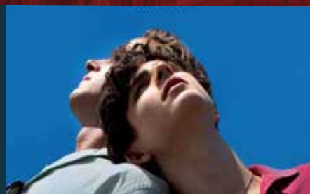
CALL ME BY YOUR NAME Feb 2-5

In Northern Italy in 1983, seventeen year-old Elio begins a relationship with visiting Oliver, his father's research assistant, with whom he bonds over his emerging sexuality, their Jewish heritage, and the beguiling Italian landscape. Directed by Luca Guadagnino, based on the acclaimed novel by André Aciman.