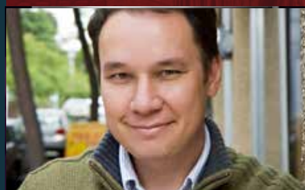
JAMIE FORD Tues Mar 6 | 7:30pm | Tickets $27 VIP: $52 $2 Lincoln member discount

His debut novel, Hotel on the Corner of Bitter and Sweet, spent two years on the New York Times bestseller list and went on to win the 2010 Asian/Pacific American Award for Literature. His work has been translated into 34 languages. Ford's half-Chinese descent lent him the idea for this powerful book about the World War II internment of Japanese Americans.