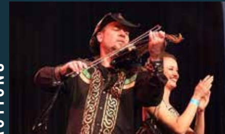
ST. PATRICK'S CELEBRATION Fri Mar 16 | 8:00pm | $15-$25 + applicable fees. $2 Lincoln member discount