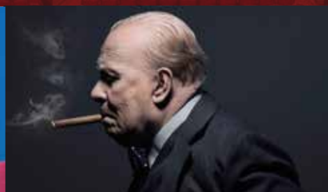
DARKEST HOUR February 9, 11, 12

A thrilling and inspiring true story begins at the precipice of World War II as, Winston Churchill (Academy Award nominee Gary Oldman) must face one of his most turbulent and defining trials: exploring a negotiated peace treaty with Nazi Germany, or standing firm to fight for the ideals, liberty and freedom of a nation.