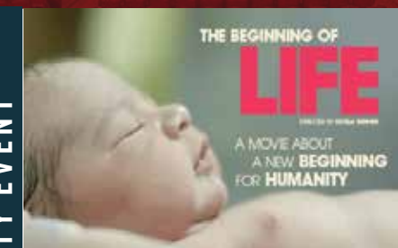
Spotlight Film Festival Thur Feb 22 | 6:30pm FREE with a suggested donation of $5.

One of the biggest discoveries in neuroscience is: When a person is born, it is not just a genetic load. We are formed by our genetics, combined with our relationship with everything around us. Be - The Beginning of Life investigates what separates us and what is essential to all of us, how we can create a better society by investing in the first years of our lives