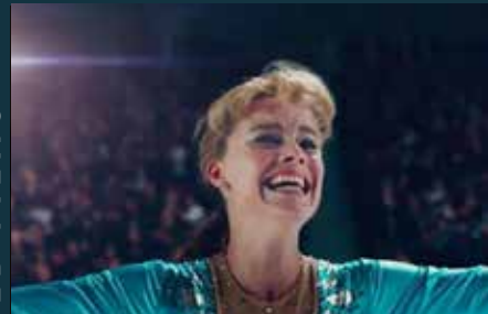
I, TONYA February 23, 25, 26, & 28

A darkly comedic tale of American figure skater, Tonya Harding, and one of the most sensational scandals in sports history. Though Harding was the first American woman to complete a triple axel in competition, her legacy was forever defined by her association with an infamous, and even more poorly executed attack on fellow Olympic competitor Nancy Kerrigan.