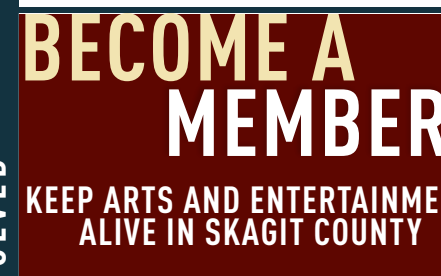
LINCOLN THEATRE MEMBERSHIP Starting at $30 | $50 for Household of four $2 off most shows | free refreshment refills

The Lincoln Theatre is supported by more than 800 members from every corner of Skagit, Whatcom and Snohomish counties as well as towns and cities throughout Washington, British Columbia, and around the world. Become a member today and make sure the curtain keeps rising!