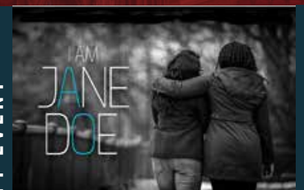
Spotlight Film Festival Thur Feb 15 | 6:30pm FREE with a suggested donation of $5.

I Am Jane Doe chronicles the epic battle that several American mothers are waging on behalf of their middle-school daughters, victims of sex trafficking on Backpage.com, the classified advertising website that for years was part of the iconic Village Voice. Reminiscent of Erin Brockovich and Karen Silkwood, these mothers have stood up on behalf of thousands of others.