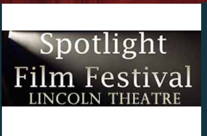
Spotlight Film Festival Thursdays, 7:00pm Feb 15-March 22 FREE with a suggested donation of $5.

The third annual Spotlight Film Festival returns! This event includes a series of six separate documentaries that shine a light on issues important to our community. Films will be featured on consecutive Thursdays from 7pm – 9pm starting February 15 and running through March 22 at the Lincoln.