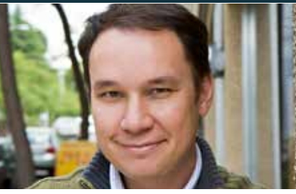
JAMIE FORD Tues Mar 6 | 7:30pm | Tickets $27 VIP: $52 $2 Lincoln member discount