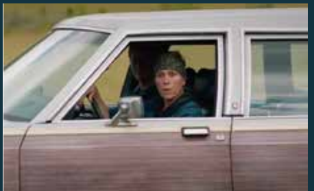
THREE BILLBOARDS OUTSIDE EBBING, MISSOURI Jan 19-Feb 1

After months have passed without a culprit in her daughter's murder case, Mildred Hayes (Golden Globe winner Frances McDormand) makes a bold move, painting three signs leading into her town with a controversial message directed at the town's revered chief of police.