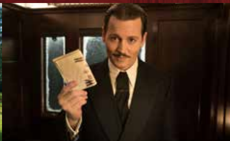
MURDER ON THE ORIENT EXPRESS Jan 12-15

What starts out as a lavish train ride through Europe quickly unfolds into one of the most stylish, suspenseful and thrilling mysteries ever told. From the novel by best-selling author Agatha Christie, "Murder on the Orient Express" tells the tale of thirteen strangers stranded on a train, where everyone's a suspect.