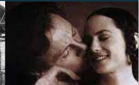
SPECTACULAR, SPECTACULAR FILM SERIES: THE PIANO Sat Jan 13 | 7:30pm

After a long voyage from Scotland, pianist Ada McGrath (Holly Hunter) and her young daughter, Flora (Anna Paquin), are left with all their belongings, including a piano, on a New Zealand beach.