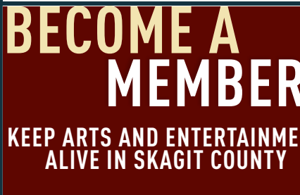
LINCOLN THEATRE MEMBERSHIP Starting at $30 | $50 for Household of four $2 off most shows | free refreshment refills

The Lincoln Theatre is supported by more than 800 members from every corner of Skagit, Whatcom and Snohomish counties as well as towns and cities throughout Washington, British Columbia, and around the world. Become a member today and make sure the curtain keeps rising!