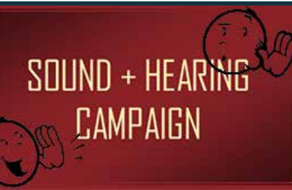
BRING SOUND TO LIFE . . . Support the Lincoln Theatre in bringing state-of-the-art sound and hearing assistance to live performances and film.

Concessions volunteers enjoy a free show, popcorn and fountain drinks. Find Volunteer Application and Disclosure Form at lincolntheatre.org/be-volunteer or in our office. Email to brandy@lincolntheatre.org . Volunteering is conditional on completed application, disclosure form and satisfactory report from the WA State Patrol.