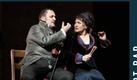
Tosca Sat Jan 27 | 9:55am $17-$23 + fees | $2 member discount

1850, and Europe's most feared terrorist is hiding in Dean Street, Soho. Broke, restless and horny, the thirty-two-year-old revolutionary is a frothing combination of intellectual brilliance, invective, satiric wit, and child-like emotional illiteracy. His writing blocked, his marriage dying, his friend Engels in despair at his wasted genius, his only hope is a job on the railway.