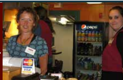
VOLUNTEER AT THE LINCOLN! Flexible Volunteer Opportunities in Concessions and more!

The Lincoln Theatre is supported by more than 800 members from every corner of Skagit, Whatcom and Snohomish counties as well as towns and cities throughout Washington, British Columbia, and around the world. Become a member today and make sure the curtain keeps rising!