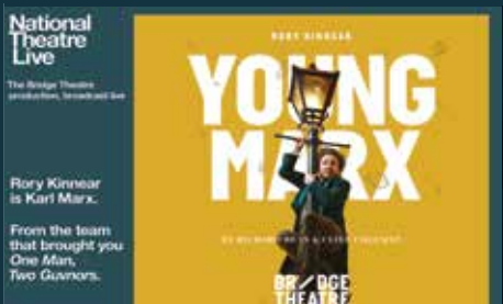
YOUNG MARX Sun Jan 7 | 1:00pm $14-$18 + fees $2 member discount

1850, and Europe's most feared terrorist is hiding in Dean Street, Soho. Broke, restless and horny, the thirty-two-year-old revolutionary is a frothing combination of intellectual brilliance, invective, satiric wit, and child-like emotional illiteracy. His writing blocked, his marriage dying, his friend Engels in despair at his wasted genius, his only hope is a job on the railway.