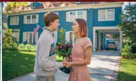
LADY BIRD Jan 5-11

Marion McPherson, a California nurse, works tirelessly to keep her family afloat after her husband loses his job. She also maintains a turbulent bond with a teenage daughter who is just like her – loving, strong-willed and deeply opinionated.