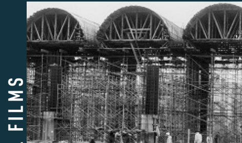
THE OPERA HOUSE January 13 | 12:55pm

The Opera House , surveys a remarkable period of the Metropolitan Opera's rich history. The film chronicles the creation of the Met's home of the last 50 years, against the backdrop of the artists, architects, and politicians who shaped the cultural life of New York City.