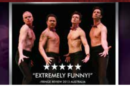
THE COMIC STRIPPERS Sat Feb 17 | 7:30pm | $32 reserved; $27 for groups of 6 or more + fees | $2 Lincoln member discount

A fictitious male stripper troupe (played by a cast of some of Canada's best improvisational comedians) performs a sexy hilarious improv comedy show. These guys try to be sexy... it just comes out funny. Constantly grooving and gyrating in between scenes they banter with the crowd and perform their hilarious twist on improv sketches. Ages 21 and over