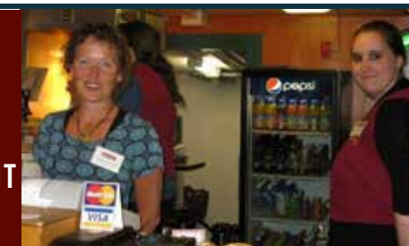
VOLUNTEER AT THE LINCOLN!

The Lincoln Theatre is supported by more than 800 members from every corner of Skagit, Whatcom and Snohomish counties as well as towns and cities throughout Washington, British Columbia, and around the world. Become a member today and make sure the curtain keeps rising!