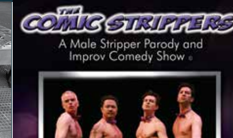
THE COMIC STRIPPERS

The Montreal Guitar Trio was so impressive when they performed with the California Guitar Trio last year we're bringing them back for their own show. Described by the CBC as the "hottest" guitar ensemble in Canada, MG3 has quickly established itself as a force to be reckoned with, as well as an interactive force in various musical forms.