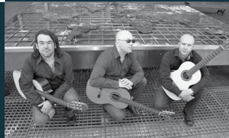
MONTREAL GUITAR TRIO

Thurs Feb 8 | 7:30pm | $20 - $35 + applicable fees. $2 off for Lincoln Theatre Members!