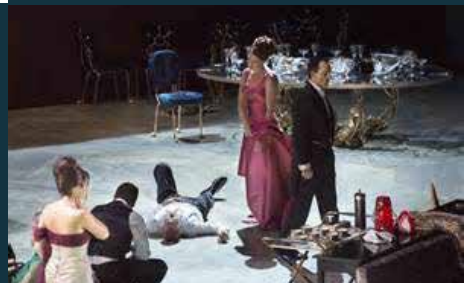
MET LIVE: EXTERMINATING ANGEL

Sat Nov 18 9:55 am | Sun Nov 26 1:00 pm Adult $23 Senior $21, Student $19, Child $17 + fees