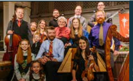
MAGICAL STRINGS CELTIC YULETIDE