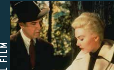
SPECTACULAR, SPECTACULAR FILM SERIES: VERTIGO

New York, 1971. There's a party on the stage of the Weismann Theatre. Tomorrow the iconic building will be demolished. Thirty years after their final performance, the Follies girls gather to have a few drinks, sing a few songs and lie about themselves.