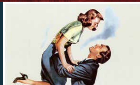
IT'S A WONDERFUL LIFE

Fri Dec 22 | 7:30 pm | Free | 135 minutes | PG