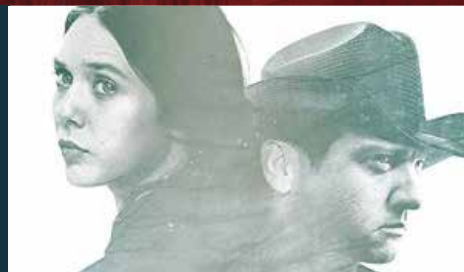
WIND RIVER Nov 3, 5 & 6

A veteran tracker with the Fish and Wildlife Service helps to investigate the murder of a young Native American woman, and uses the case as a means of seeking redemption for an earlier act of irresponsibility which ended in tragedy.