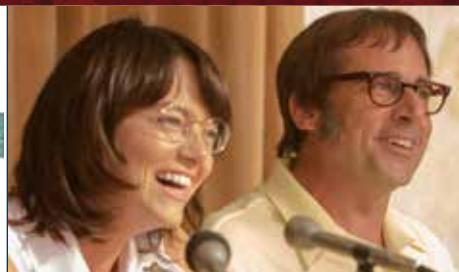
BATTLE OF THE SEXES Nov 10-13

The electrifying 1973 tennis match between World number one Billie Jean King and ex-champ and serial hustler Bobby Riggs became the most watched televised sports event of all time. The match caught the zeitgeist and sparked a global conversation on gender equality, spurring on the feminist movement.