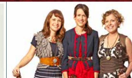
THE GOOD LOVELIES

Frank Capra's classic bittersweet comedy/drama about George Bailey (James Stewart) who wishes he had never been born, an angel (Henry Travers) who is sent to earth to make George's wish come true. George starts to realize how many lives he has changed and impacted, and how they would be different if he was never there.