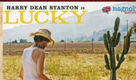
LUCKY Nov 24-27

Regular Film Prices | 121 minutes | PG 13