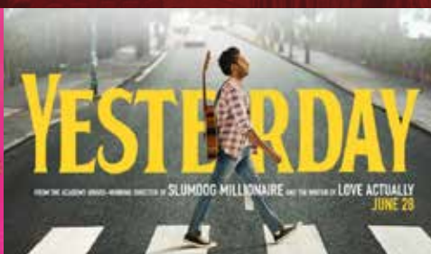
YESTERDAY Sept 13-16

Jack Malik is a struggling singer-songwriter in a tiny English seaside town whose dreams of fame are rapidly fading, despite the fierce devotion and support of his childhood best friend, Ellie. Then, after a freak bus accident during a mysterious global blackout, Jack wakes up to discover that The Beatles have never existed... and he finds himself with a very complicated problem, indeed.