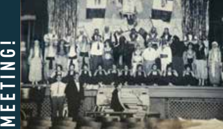
ANNUAL MEMBER MEETING

Sun Oct 6 | 5:30pm | All Seats $8-$10.50 Lincoln Theatre Members receive $2 off Manhattan Short is not a touring Festival; rather, it is an instantaneous celebration that occurs simultaneously across the globe, bringing great films and great artists to great venues and allowing the audiences to select their favorites. All films selected in Manhattan Short 2019, will be eligible to enter the Oscars in 2020, via the Manhattan Short Oscar Qualifying Screenings at Los Feliz 3 Cinemas in the county of Los Angeles.