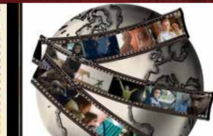
MANHATTAN SHORT FILM FESTIVAL

Concessions volunteers enjoy a free show, popcorn and fountain drinks. Find Volunteer Application and Disclosure Form at lincolnthatre.org/be-volunteer or in our office. Email to brandy@lincolnthatre.org . Volunteering is conditional on completed application, disclosure form and satisfactory report from the WA State Patrol.