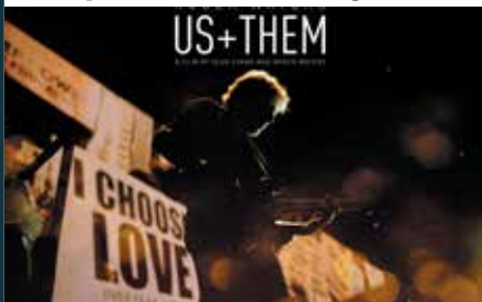
ROGER WATERS US + THEM

Wed Oct 2 | 7:30pm $12 Festival Seating $2 discount for members