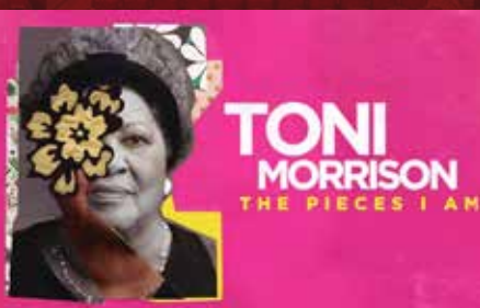
TONI MORRISON THE PIECES I AM Sept 6-9

This artful and intimate meditation on the legendary storyteller examines her life, her works and the powerful themes she has confronted throughout her literary career. Toni Morrison leads an assembly of her peers, critics and colleagues on an exploration of race, history, America and the human condition.