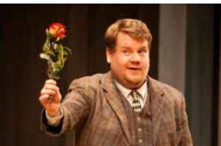
NT LIVE: ONE MAN, TWO GUVNORS

See the hilarious, award-winning, one-woman show broadcast live to the Lincoln from London's West End. Fleabag may seem oversexed, emotionally unfiltered and self-obsessed, but that's just the tip of the iceberg. With family and friendships under strain and a guinea pig café struggling to keep afloat, Fleabag suddenly finds herself with nothing to lose.