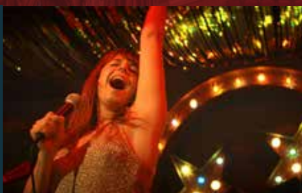
WILD ROSE Aug 31 - Sept 2

Wild Rose tells the complicated story of Rose-Lynn, a woman on a quest to become a country music star, while also grappling with the responsibilities of being recently released from prison and a young mother of two children