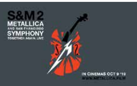
METALLICA & SAN FRANCISCO SYMPHONY

Filmed in Amsterdam on the European leg of his 2017-2018 Us + Them tour which saw Roger Waters perform to over two million people worldwide, the film features songs from his legendary Pink Floyd albums (The Dark Side of the Moon, The Wall, Animals, Wish You Were Here) and from his last album, Is This The Life We Really Want?