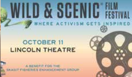
WILD AND SCENIC FILM FESTIVAL

Sept 14 & 15 | 3:00pm | All Seats $8-10.50 Lincoln Theatre Members receive $2 off Sing a long with Willy Wonka, Charlie Bucket and Grandpa Joe, as the last of five coveted "golden tickets" falls into the hands of a sweet but very poor boy. He and his grandpa then get a tour of the strangest chocolate factory in the world. The owner leads five young winners, Augustus Gloop, Violet Beauregarde, Veruca Salt, Mike Teavee, Arthur Slugworth on a thrilling and often dangerous tour of his factory.