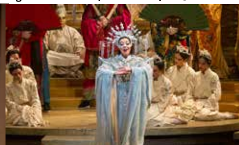
THE MET LIVE IN HD: TURANDOT

Fired from his skiffle band, Francis Henshall becomes minder to Roscoe Crabbe, a small time East End hood, now in Brighton to collect £6,000 from his fiancée's dad. But Roscoe is really his sister Rachel posing as her own dead brother, who's been killed by her boyfriend Stanley Stubbers.